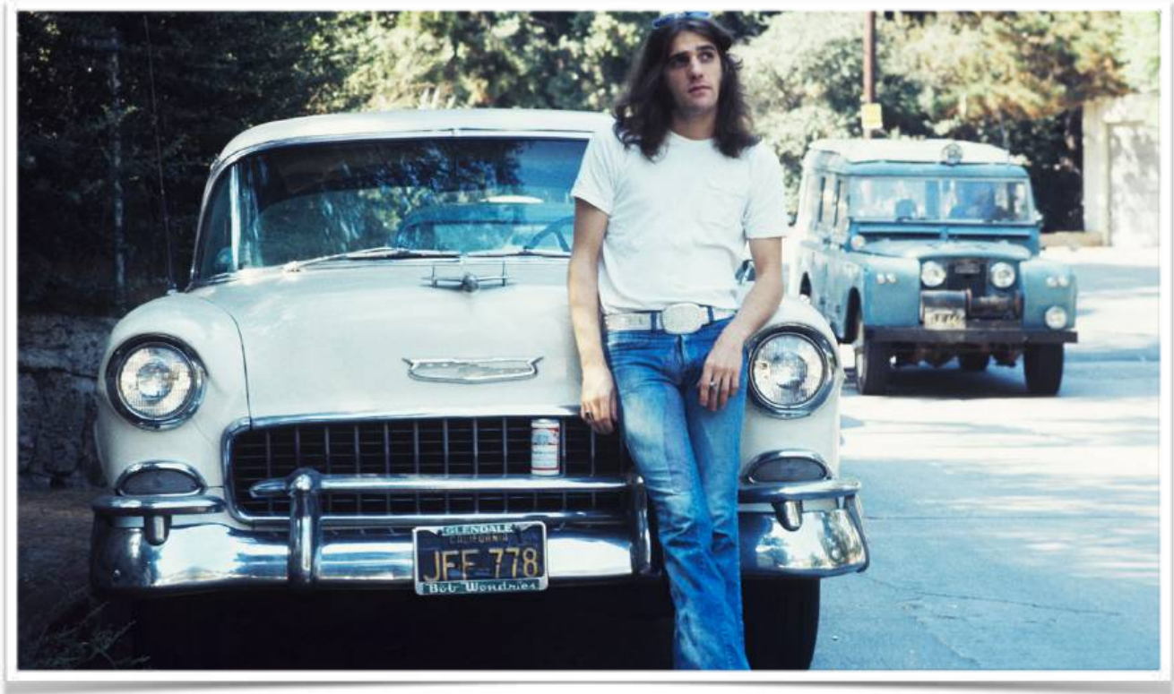
Above: The late Glen Frey of the Eagles asks a 55 Chevy to hold his beer while he basks in the Southern California sun (circa 1970's). Below: Memphis' own Union Chevrolet in the late 1950's.